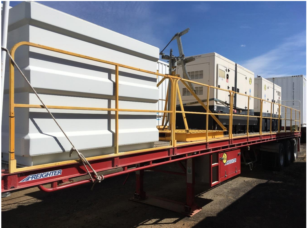
Rig 1, 2 & 3 Main Camp List